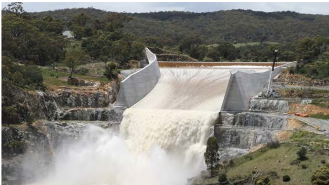
Enlarged Cotter Dam spillway in overflow, 2014